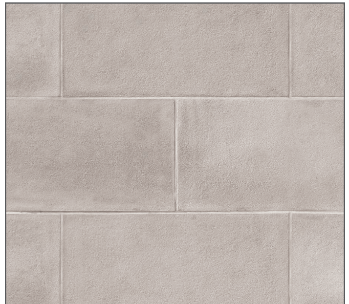
SMOOTH LIMESTONECOLOR: HARVARD GREY